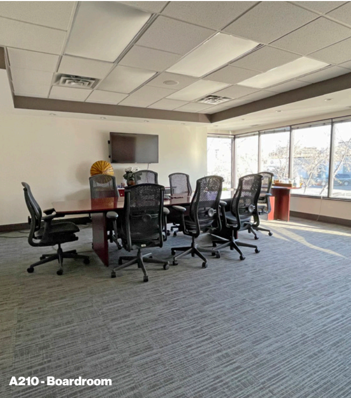
A210 - Boardroom