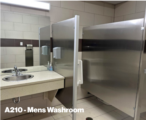
A210 - Mens Washroom