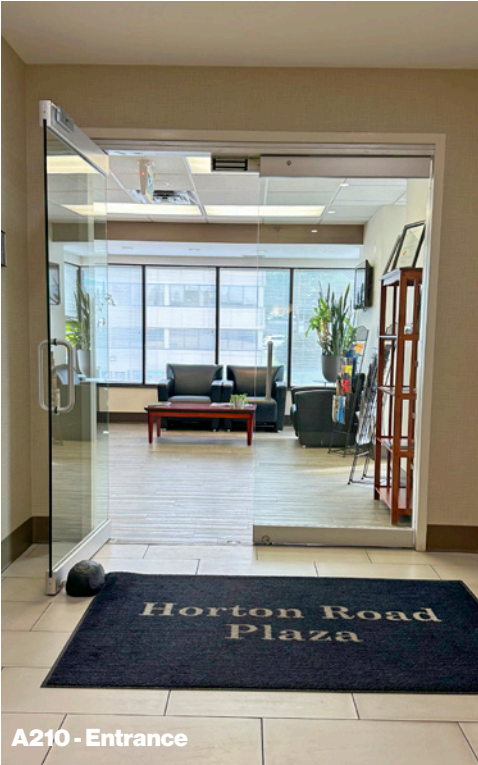
A210 - Entrance