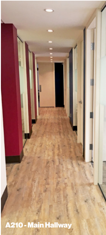
A210 - Main Hallway