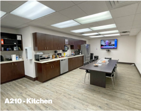
A210 - Kitchen